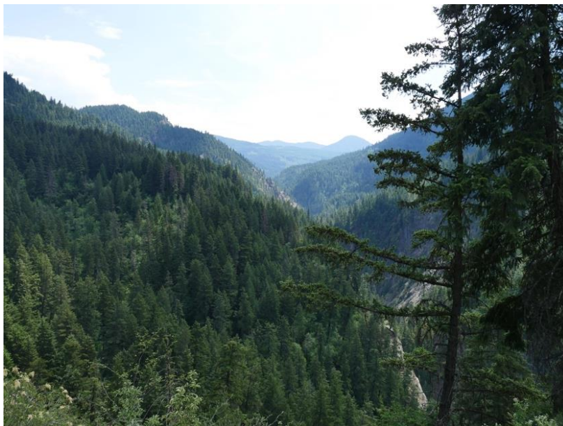
Figure 4. Stoyoma Mountain, a previously protected and culturally significant area within the traditional territory of the Nlaka'pamux First Nation that has recently been approved for logging activity (Esh-kn-am, Merritt, BC, pers. comm. 2018).