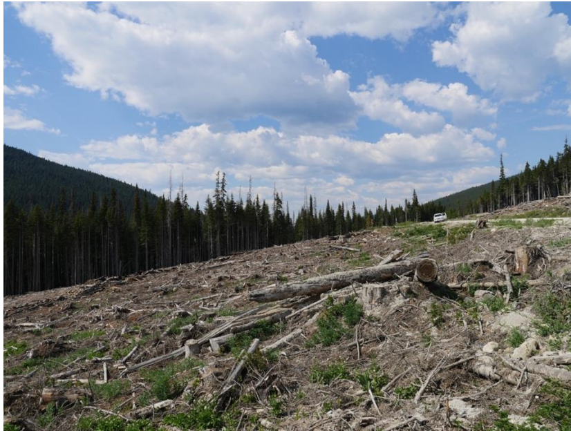
Figure 3. A cut block near the Coquihalla Lakes, an area that has been extensively logged and was previously important traditional hunting territory for surrounding First Nation Communities.

these communities feel as though logging has decreased the quantity and quality of ungulate habitat, it is important to note that it has improved gathering for some plant-based foods such as huckleberries (Esh-kn-am, Merritt, BC, pers. comm. 2018).