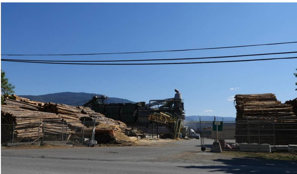
Figure 2. Aspen Planers lumber mill located in the town of Merritt, BC.

The practice of clearcutting and its effects on terrestrial ecosystems is a controversial topic and outside the scope of this paper, but it is important to note some of the documented ecological effects that relate to the concerns of the local communities. Logging has been known to improve forage for deer; however, it is also known to disrupt ungulate populations through sensory disturbances, habitat alterations, and can impact the usability of the forage produced (Stelfox et al. 1976, Scotter 1980). Clearcutting practices are known to increase surface runoff, therefore decreasing the amount of water stored within the watershed (Harris, 1997). Clearcutting is also known to change the composition of vegetation, such as increasing the abundance of shade intolerant species and decreasing the abundance of shade tolerant species, but other forest management practices such as fire suppression can also effect species composition (Elliot et al., 1997). Logging reduces canopy cover and drastically changes habitat for species in a short time frame; however, proper management and application of these logging practices can reduce the severity of these effects and may benefit local wildlife (Fuller et al., 2004).